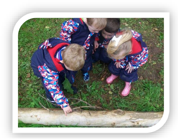
Learners enthralled by a Forest School activity

Outdoor learning is a key feature of learning at Auchnacraig and, in the 2011 inspection report for the centre, the quality of the children's learning experience outdoors and in the Forest School were identified as key strengths. Also highlighted was the strong and supportive partnerships with parents, the inclusive nurturing environment for learning and the focus that was given to