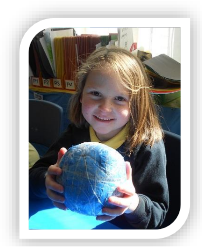
Having a ball with global citizenship