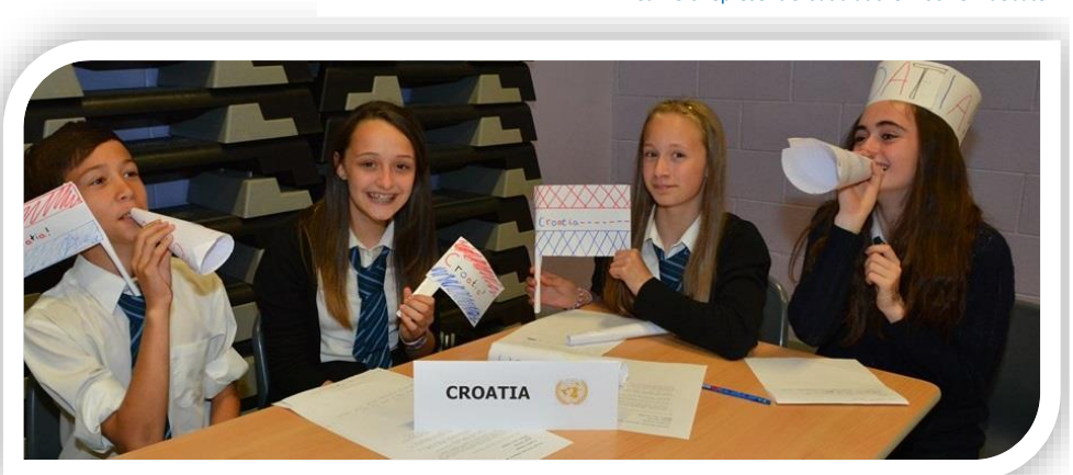
Learners represent Croatia at the mock UN debate