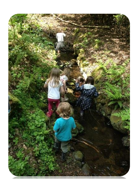
Learners from Cowgate Under 5's Centre venture up a stream at Stickland

Scotland embraced the opportunity and the Scottish Government produced two action plans, Learning for the Future <sup>3</sup> and Learning for Change <sup>4</sup>, to set out its ambitions and targets for each half of the Decade. Within the school sector, the biggest achievements have arguably been the embedding of global citizenship and sustainable development education as themes across learning<sup>5</sup> within the new national curriculum, Curriculum for Excellence. The embedding of outdoor learning<sup>6</sup> as a key pedagogical