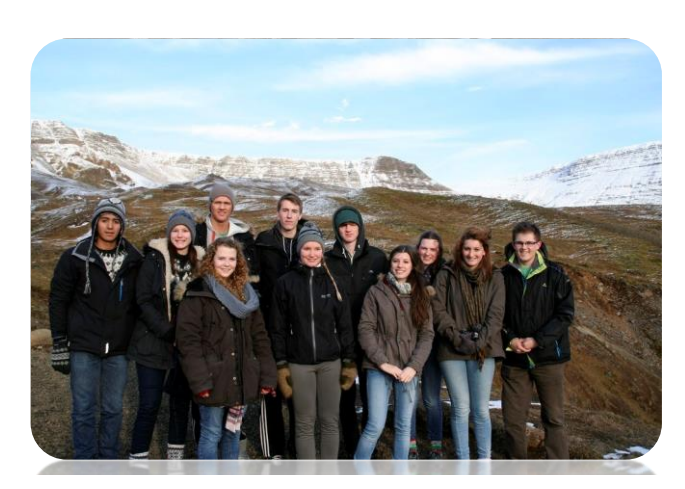
Learners on their Comenius visit to Iceland

The school has active Eco-Schools and Fairtrade groups and a Pupil Council. Learners also help to run a community orchard which was established to reduce food miles, encourage healthy eating and to provide opportunities for the community to become more involved with the school. And in 2014, senior learners participated in a Commonwealth Youth Summit linked to the Glasgow 2014 Games.