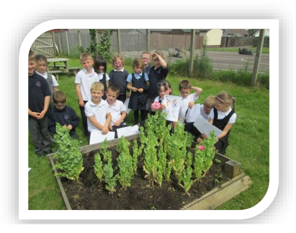
The school's eco garden springs to life

The school aims to provide learners with a stimulating learning environment supported by an ethos of encouraging achievement and celebrating success. Staff at all levels are keen to embrace change and actively promote partnership working with parents/carers, the local