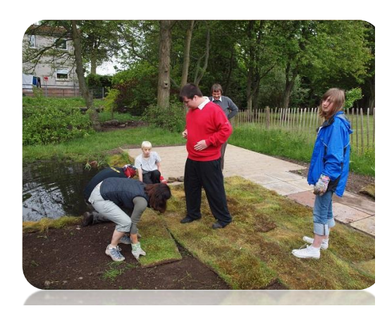
Putting finishing touches to the pond at Kilmaron School

The case studies included in this report provide details about the journey each school and centre has taken and describe the main activities and programmes they have supported. They also, through the inclusion of quotes, attempt to capture the richness of the discussions that took place. They