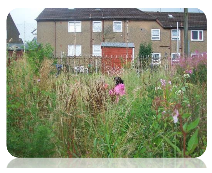
Children enjoying wild spaces