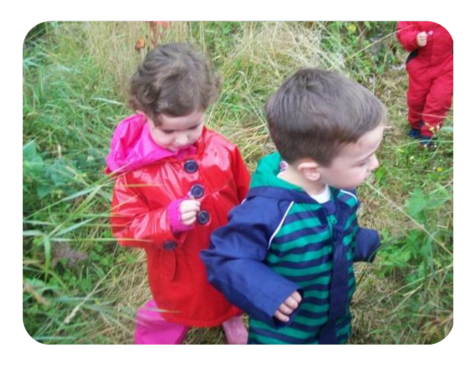
Learners at Auchnacraig Nursery go in search of wild spaces

The future is yet unwritten and we cannot know what challenges and triumphs will await us in the coming years. However, if the case studies in this document are anything to go by then we can be confident that children and young people across Scotland are being encouraged in large numbers to care deeply about justice and are being equipped with the skills, knowledge, confidence and leadership abilities required to find solutions and build a more sustainable Scotland, and a better world.