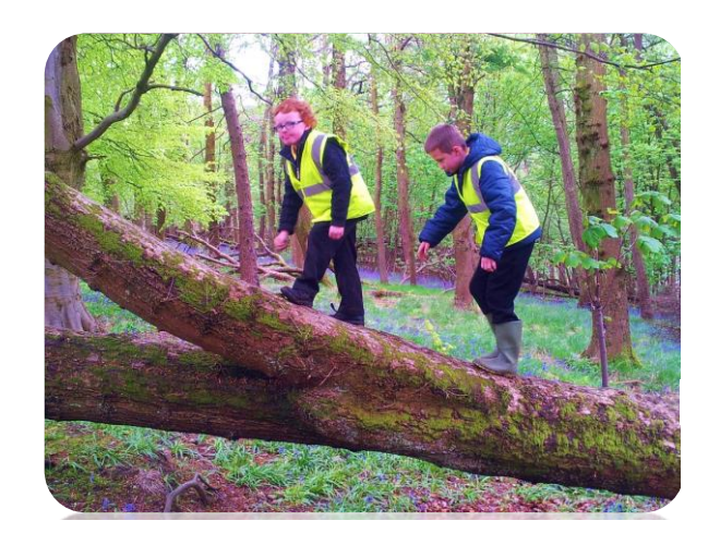
Learning to manage risks

Conversations took place with the headteacher, two members of the senior management team, two members of staff with responsibilities for coordinating learning for sustainability activities, two parents and nine learners. All participants felt that the school's approach to global citizenship and outdoor learning had led to the following positive outcomes: