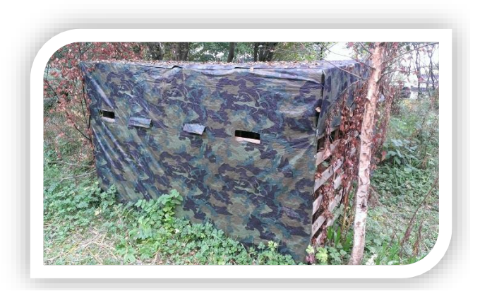
Bird hide made from wooden pallets

Pupils' active involvement in learning and their skills in listening, talking and working together.