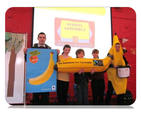
Learners at Mary Russell School at their Fairtrade assembly

Sustainable development education, global citizenship, international education, education for citizenship and outdoor learning have now been embedded within the national curriculum - Curriculum for Excellence, and many schools are successfully weaving these together with children's rights and play to develop coherent whole school approaches to learning for sustainability.