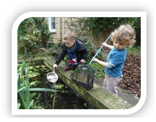
Learning to be scientists

The nursery's journey towards sustainability began in 1992 when it sought to transform its tarmac playground into an imaginative and stimulating environment that would provide ample