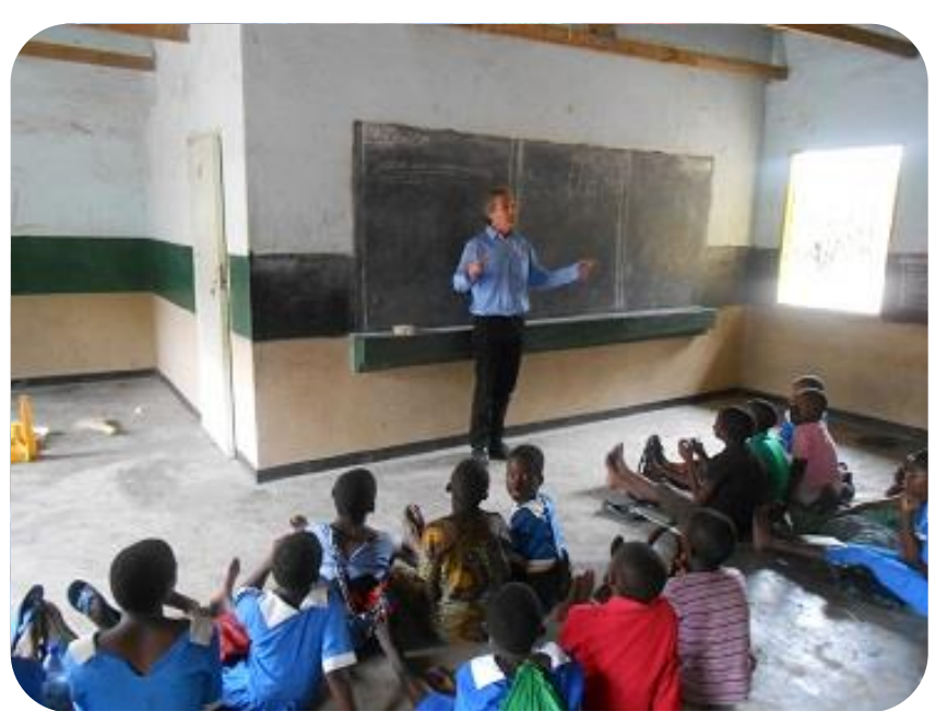
The link with Malawi has promoted understanding of other peoples and cultures