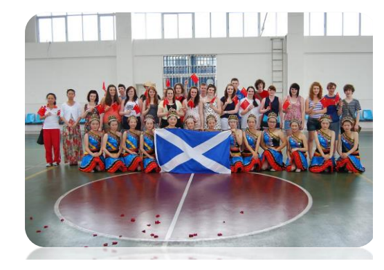
A visit to No. 3 Middle School, Yuxi, China