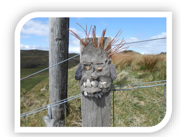
Even fence posts in Luing have character

Confident and well-behaved children who are very proud of their school and enjoy the wide range of activities to raise achievement