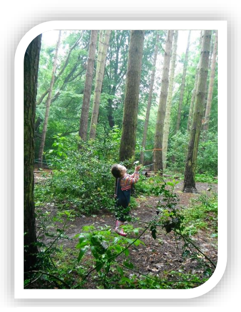
Enjoying the wonder and awe of nature at Stickland

The quality of the experiences that Cowgate offers learners has been recognised in a number of ways. In 2008 the centre won the Nursery World Awards and it has also achieved an Investors in Children Award. The centre has also gained four Green Flag Awards with Eco-Schools Scotland and in its most recent inspection in 2014 the quality of children's learning at Cowgate was described as 'outstanding'. As a result of its achievements, the centre receives many national and international visitors.