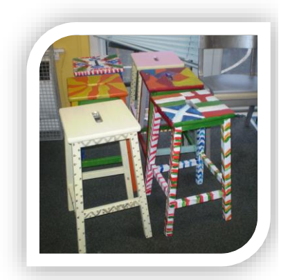
Upcycling old science lab stools

Sustainable development education (SDE) has been a large part of the school's culture and ethos for more than 10 years and has been supported by the passion and commitment of the recently-retired headteacher who was amongst the first group of practitioners to gain Professional Recognition<sup>43</sup> in SDE from the GTCS. Key to the school's approach has been to embed sustainability within the curriculum at all levels, for example, through themes relating to fossil fuels, transport and the