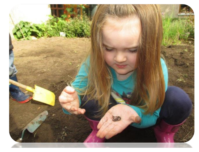
Girl at Doune Nursery gets to grips with nature

The visits to the schools and centres took place between June and September 2014.