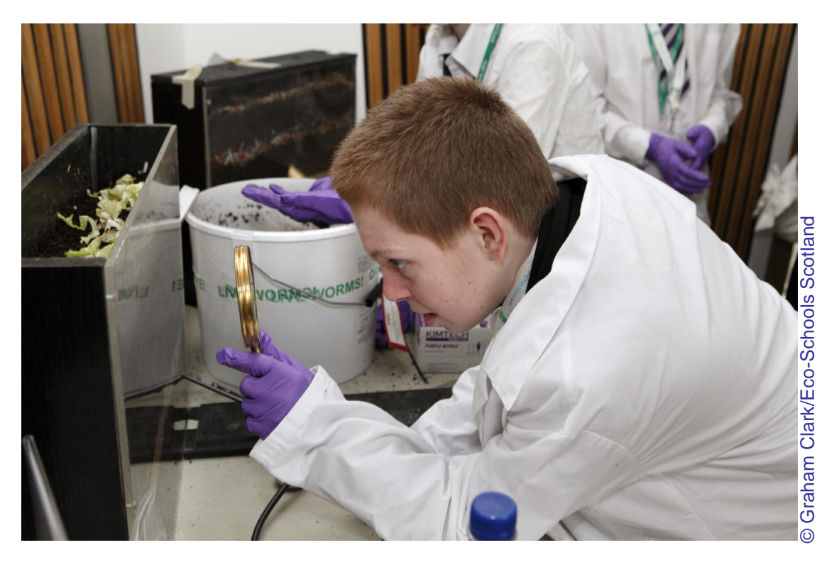
Eco-Schools Secondary Conference in the Scottish Parliament, 2012